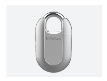
1 inch Shackle – Anti-cut Cover